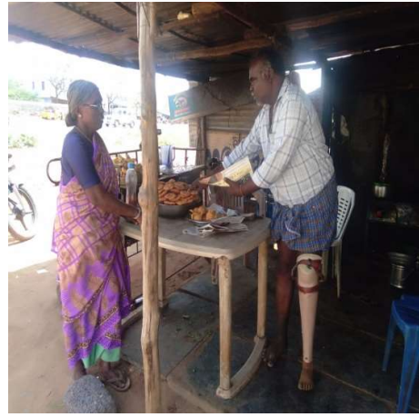
Tiffin centre run by disabled person