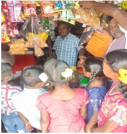
Petty shop run by PWDs