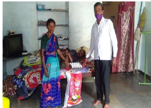
Nutrition food distributed to Spinal Cord Injury persons by SACRED Staff

SACRED supplying medicines and education, counselling for mentally ill persons through home based visits by SACRED staff. 294 mentally ill persons received medicines, out of which 105 mentally ill persons stabilized and drop the medicines.