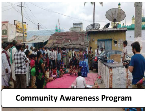
Community Awareness Program