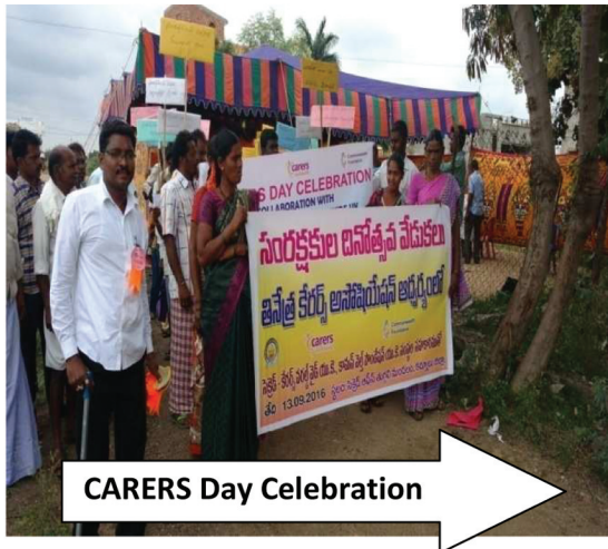
CARERS Day Celebration