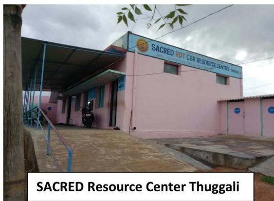
SACRED Resource Center Thuggali