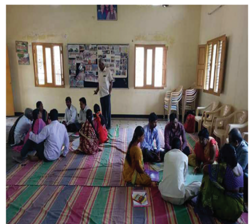
SHG Leaders Capacity building Trg