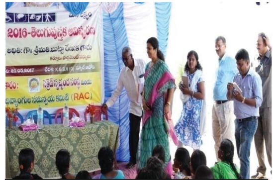
PWD Act 2016 Telugu Version inauguration by Honorable MP Smt Butta Renuka Adhoni.