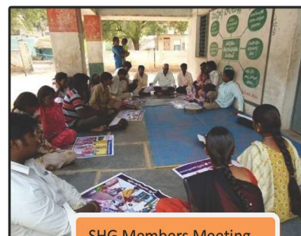
SHG Members Meeting

As many as 6785 Persons with Disability covered with Male 4245 and Female 2540 were organized in to 752 SHGs. They are functioning effectively and receiving appropriate quality services and inputs to access the schemes and services from Government and Other service providers like SACRED and RDT NGO's.