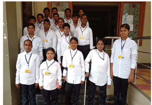
Youth for Job