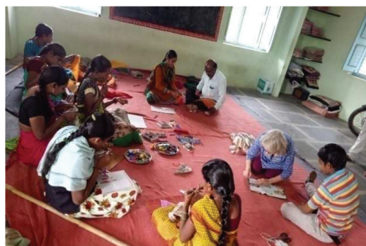
Vocational Skill Trg by Clare Volunteer From UK