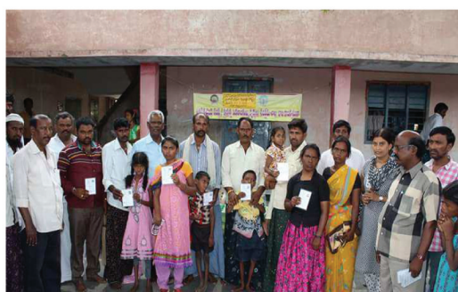
PWD Persons with NIRAMAYA CARDS