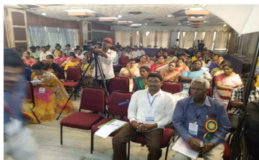
SEMINAR on PWD ACT - 2016